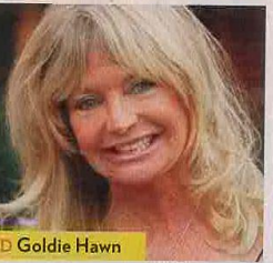
D Goldie Hawn