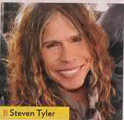
B Steven Tyler