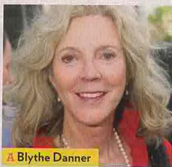
A Blythe Danner

In honor of Grandparents Day (September 13), can you match these celebs to their grandkids?