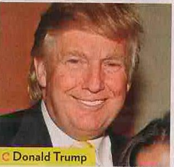
C Donald Trump